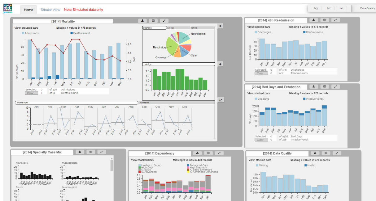
Figure 1 Prototype of main dashboard view for the paediatric intensive care audit network (using simulated data).

with NCAs mean the potential for NCA data to inform QI is not being realised. 6,7